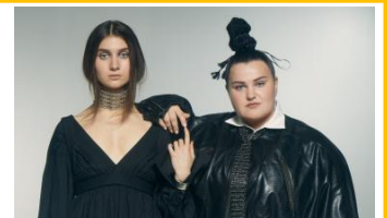
Ukraine alyona alyona & Jerry Heil - Teresa & Maria